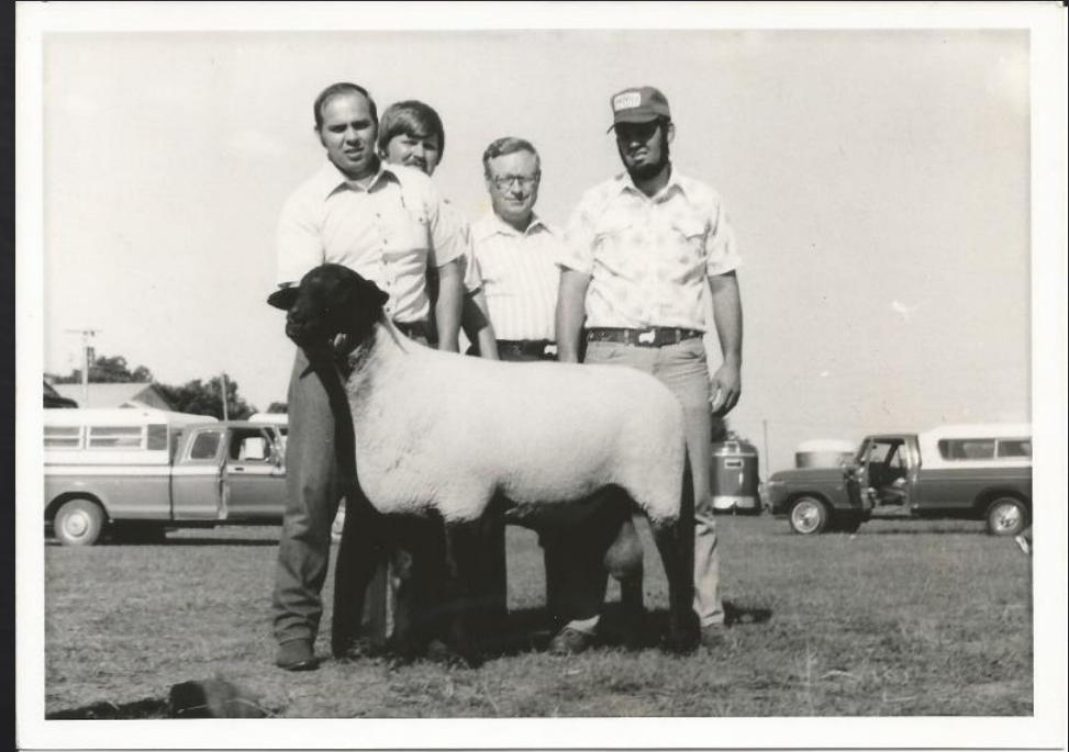
DYNAMITE World record selling Ram Sedalia 1976